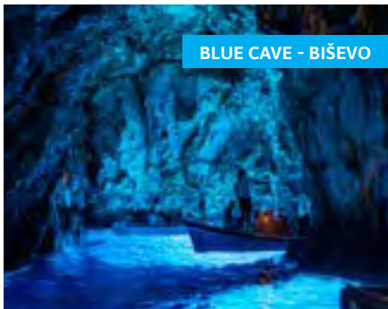
BLUE CAVE - BIŠEVO