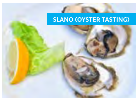
SLANO (OYSTER TASTING)